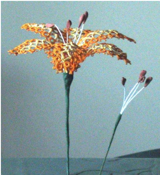
Completed flower - note the overlapping petals to produce a natural shape.